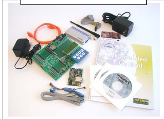
Z-World's M2M Application Kit

AIRDESK is the leading provider of wireless data solutions and services focusing on the rapidly growing machine-to-machine (M2M) and telemetry market segments. AIRDESK specializes in offering products and services to corporate entities that integrate wireless data modules for their own needs, as well as to integrators and original design manufacturers developing wirelessly enabled solutions for various embedded commercial and industrial applications. As a one-stop wireless resource, AIRDESK is in the unique position of being able to objectively draw from virtually any wireless product technology to deliver the best solution for a customer's needs, as well as to facilitate provisioning and account activation through the nation's leading wireless service providers.